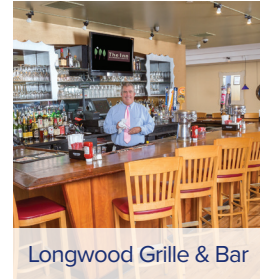
Longwood Grille & Bar