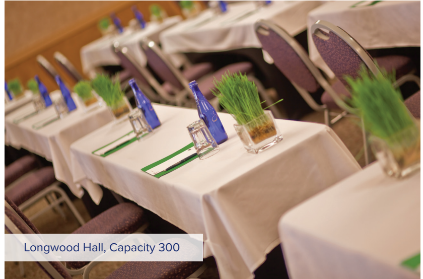
Longwood Hall, Capacity 300

Located In Boston's Longwood Medical, Harvard Medical School and Fenway area – we are right next door to Children's Hospital, Dana Farber Cancer Institute, and across the street from Beth Israel Deaconess Medical Center. We're also right near Joslin Diabetes and 1 block from Brigham and Women's Hospital, the Shapiro Clinic. Plus, we are only blocks from Northeastern University, Boston University, and the Colleges of the Fenway.