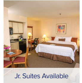
Jr. Suites Available